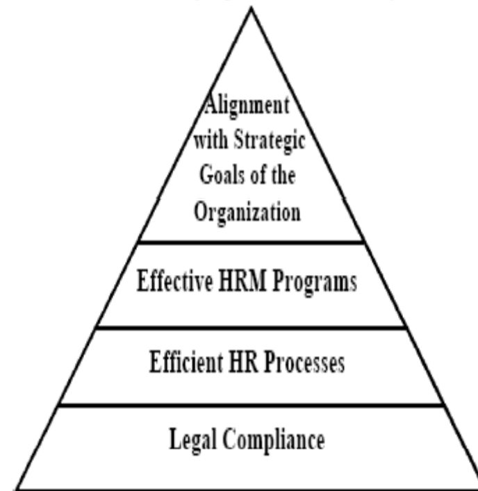
Hierarchy of Accountability